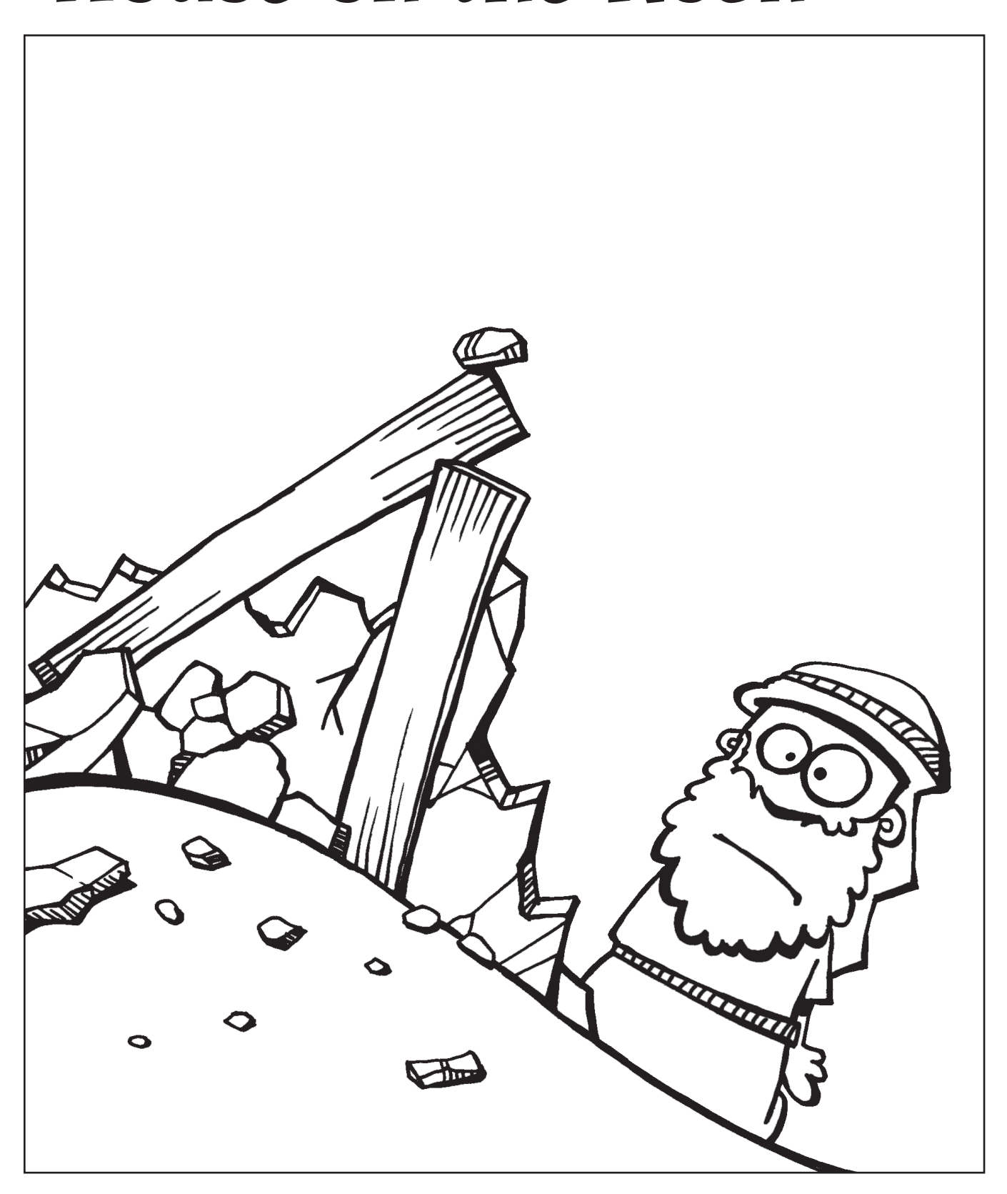
The house on sand — crash! — it fell down!