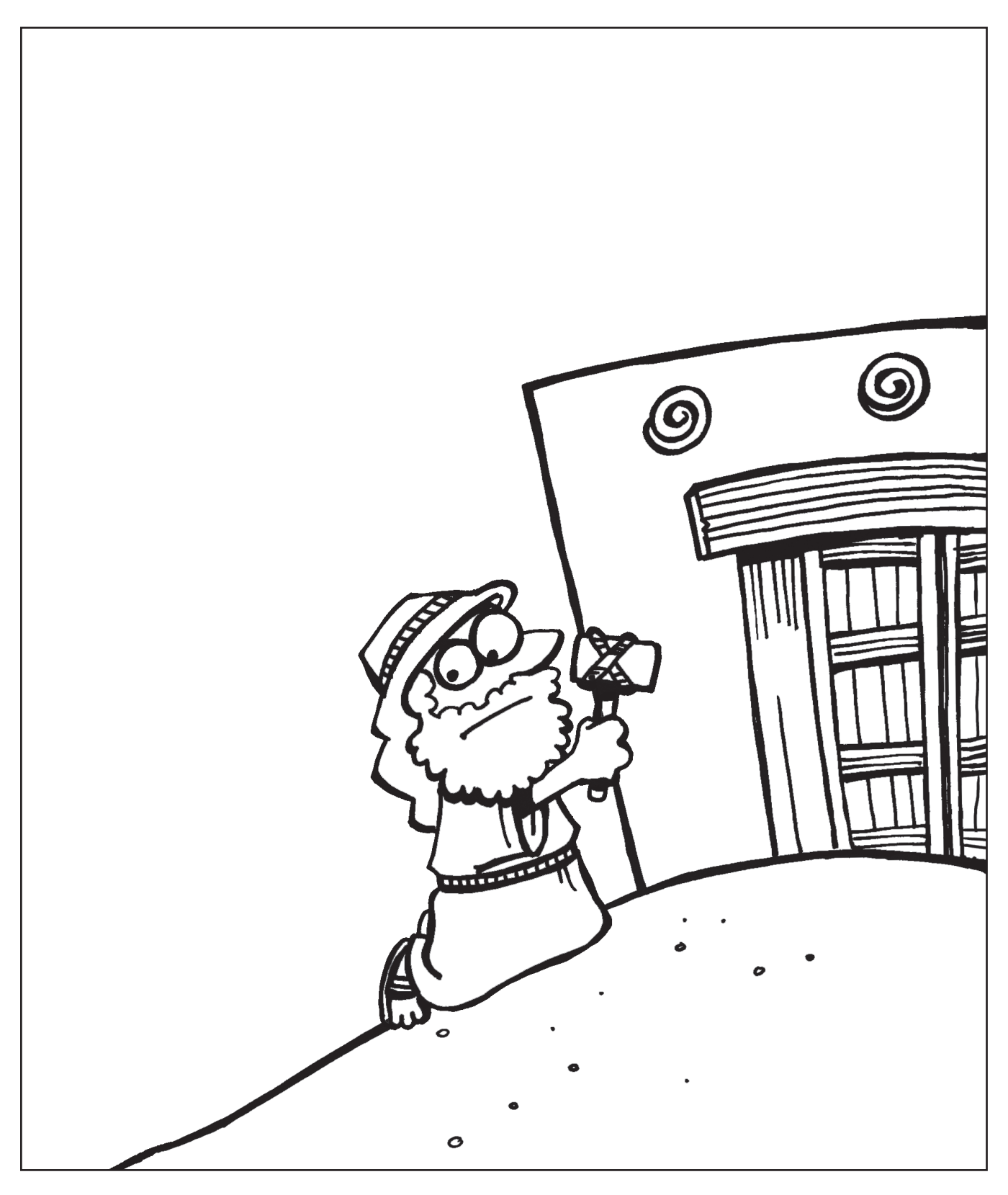
The silly person built a house on sand.