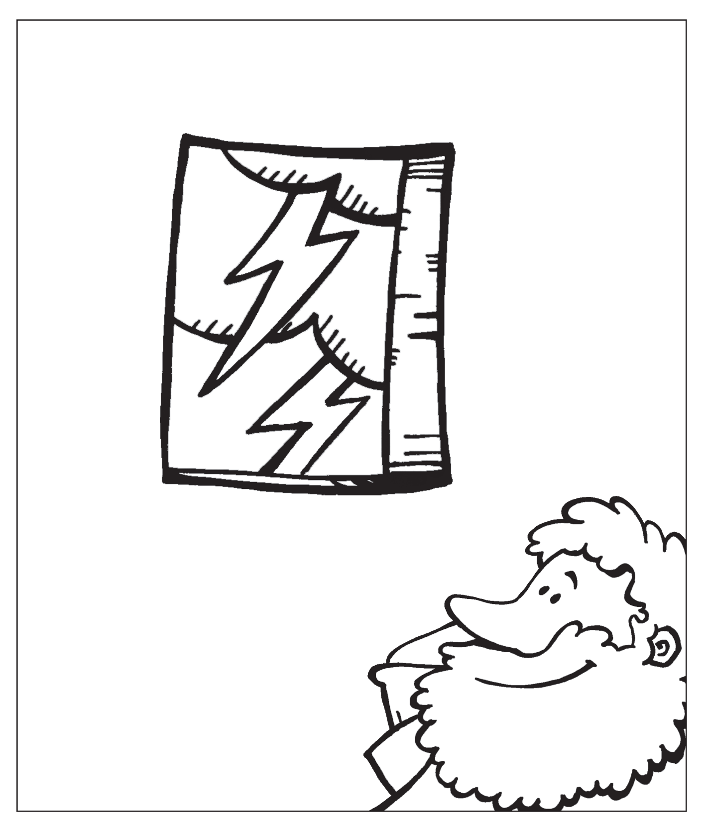
The house didn't fall down, because the smart person had built it on a sturdy rock!