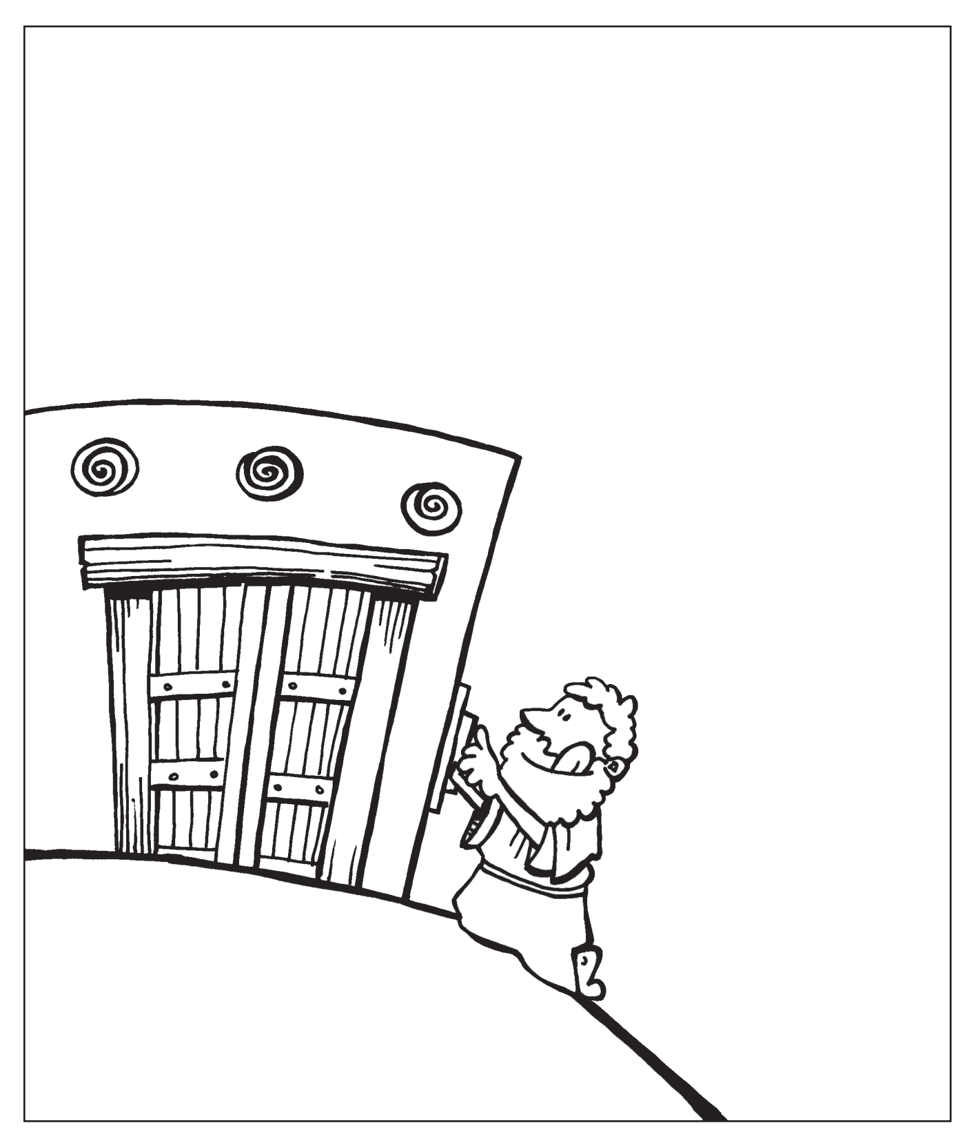
The smart person built a house on a sturdy rock.